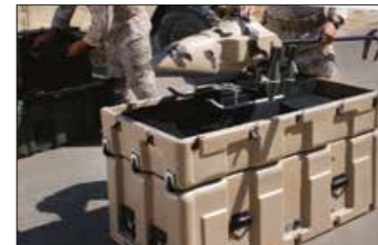
UNMANNED AIRCRAFT VEHICLE

+ +60 YEARS OF EXTREME APPLICATIONS HAVE FORGED OUR TECHNICAL EXPERTISE. CONTACT US FOR OTHER CASE STUDIES.