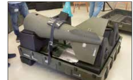
WEAPON GUIDANCE KIT