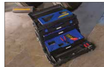
PORTABLE MECHANICS TOOL KIT