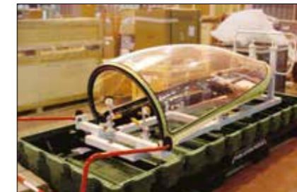
AIRCRAFT CANOPY DECK