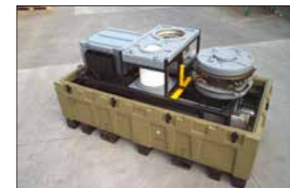
C130 PROPELLER EXCHANGE KIT