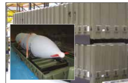
AIR TO AIR REFUELING POD