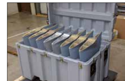
WEAPON GUIDED FINS