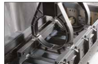
SHOCK MOUNTED SOLUTION FOR UAV