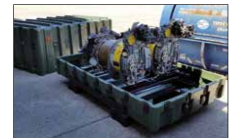
TURBO ENGINE PT6