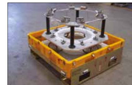
ENGINE COMPRESSOR MODULE